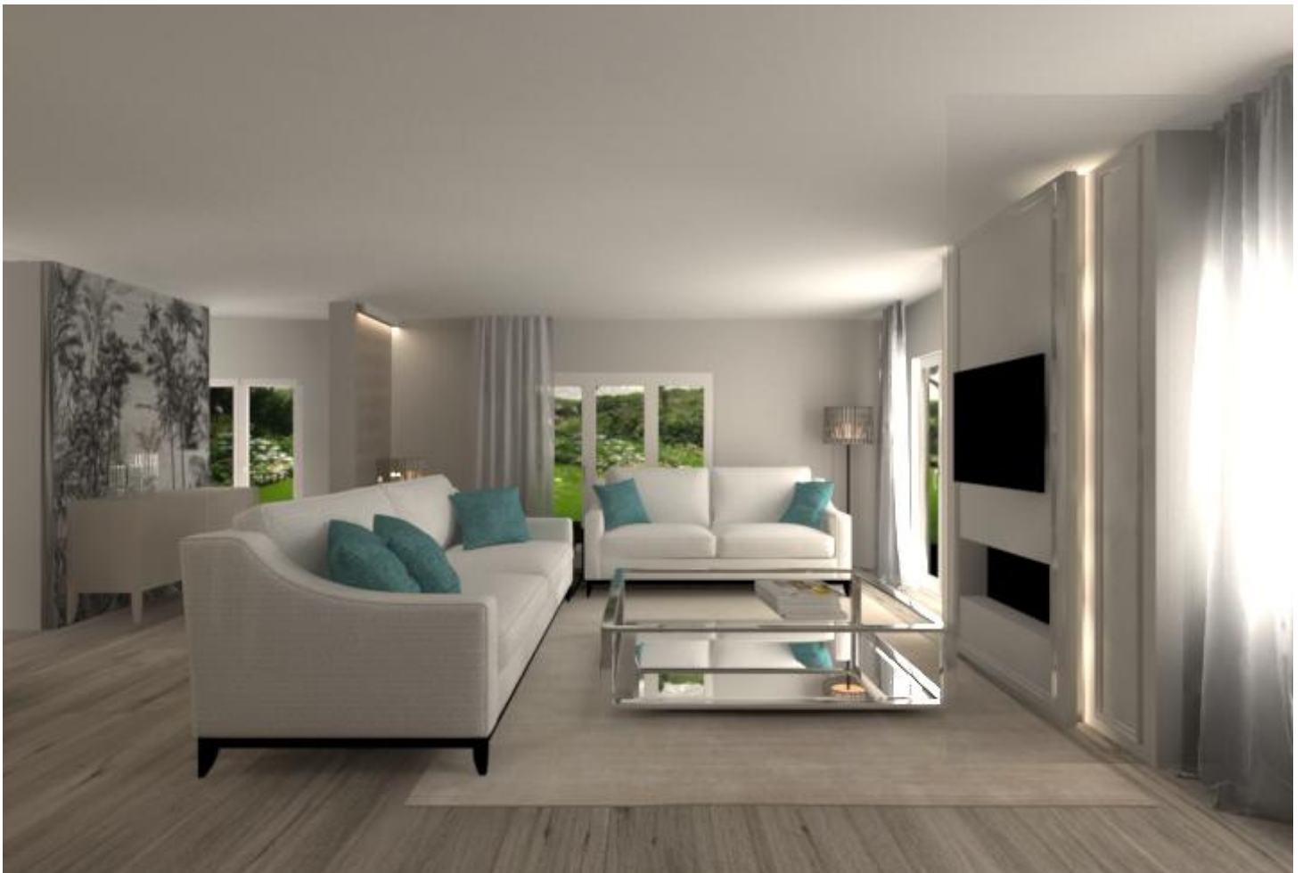
VILLA FORTE DEI MARMI